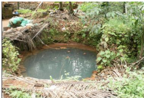
The Woman at the Well

Use this resource at home to guide your household's daily devotions.